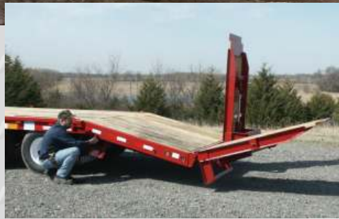
Easy to operate controls.