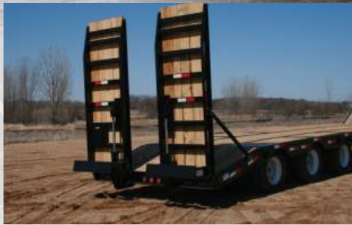
Solid-bar ramp holdups.