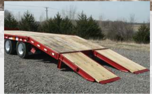
Wood-topped or steel cleat.