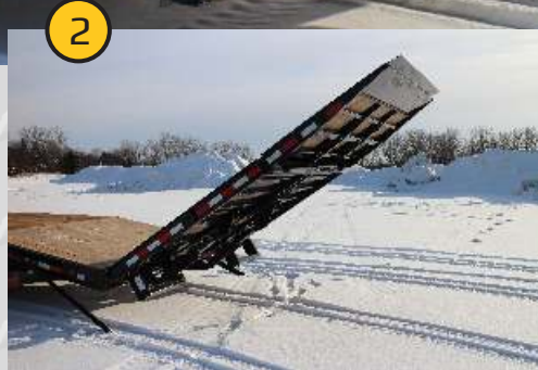
Raise tail section...