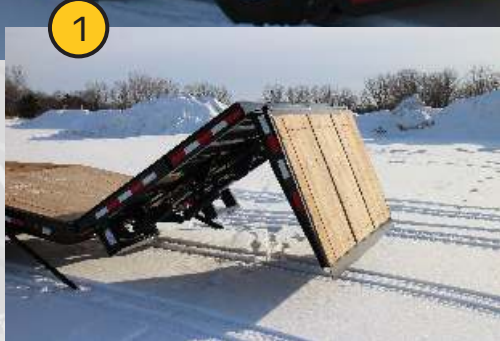
Simple operation. Lower ramp part way...