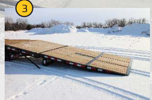
Finish lowering ramp for a low loading angle of approximately 9°.