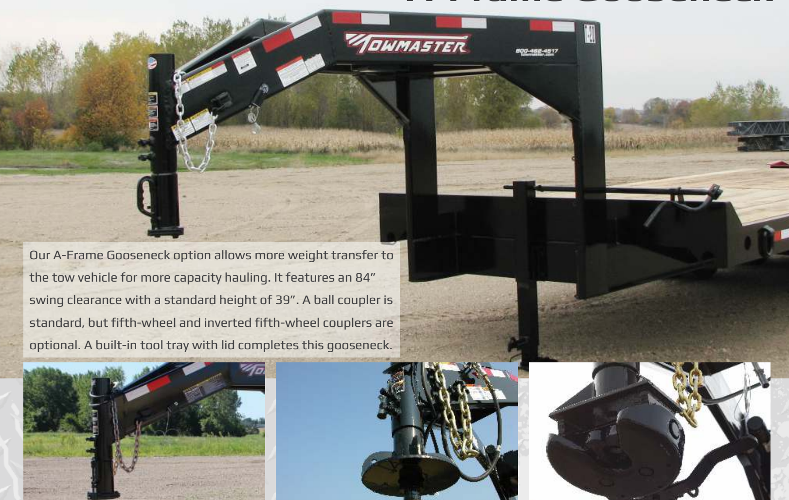
Standard ball hitch.