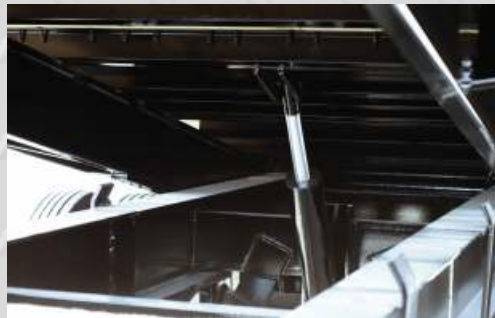
Cushion cylinder controls the deck tilt when loading or unloading equipment. Optional Hutchens® 9700 suspension shown.