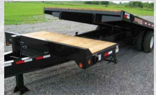
4-foot stationary deck is standard and allows room for longer equipment and the added length makes towing easier.