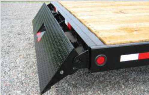
Patented automatic kick-out ramp doubles as under-ride protection.

Towmaster's® deck-over tilt trailers offer convenience and durability. No ramps to hassle with, simply tilt the deck and drive on or off. It features our patented automatic kick-out ramp that doubles as under-ride protection, a single-lever twin-latch system, stationary forward deck, Hutchens® suspension, and a deck cushion cylinder to ease the deck up and down.