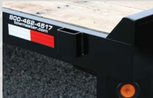
Stake pockets are standard. Grommet mounted LED lights are standard.