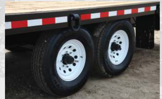
Rubber torsion axles provide smooth suspension and ride.