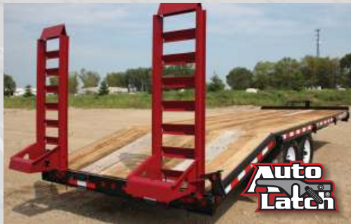
Wood topped beavertail and exclusive Auto-Latch® ramp hold-ups.

This small deck over equipment trailer is just the right size for hauling lighter, bulky equipment. The TC-series by Towmaster® features a 5-ft. wood-filled beavertail and 8 ft. wide deck. Dexter® Torflex® axles give this model a predictable, smooth ride. Our patented Auto-Latch® ramp hold-ups are standard and stake pockets provide a secure place for tying equipment. This model is designed for wider small equipment that doesn't require the heavier weight rating of our large deck-over trailers.