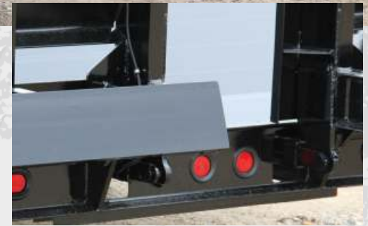
Ramp control levers through tailboard.