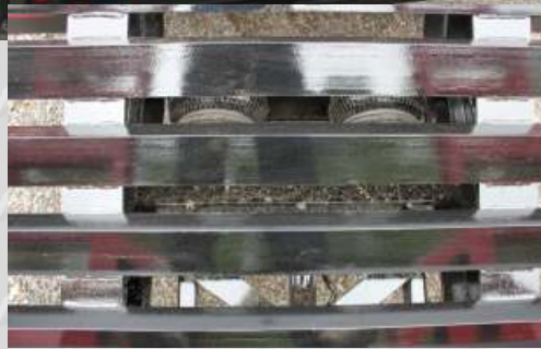
Air actuators located under beavertail.