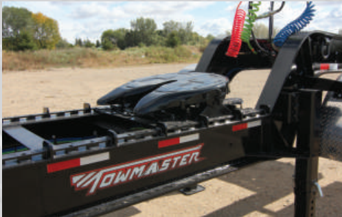
41" sliding adjustable fifth wheel.