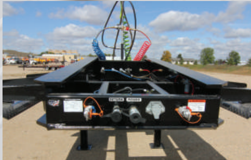
Heavy-duty main frame with conveniently located air and electrical connectors.