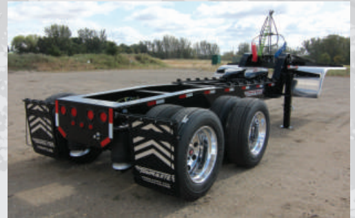
Air ride suspension.