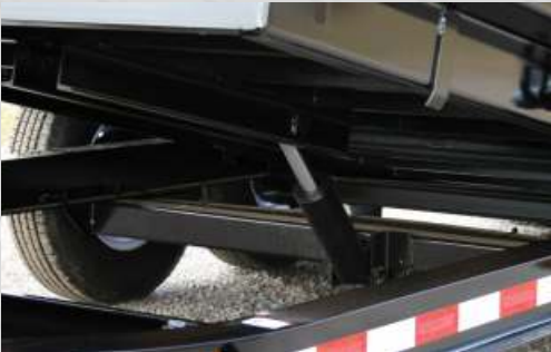
Cushion cylinder controls the deck when loading or unloading equipment.

rubber-ride axles and adjustable hitch. A deck cushion cylinder eases the deck back into transport position and prevents it from slamming onto the frame while loading.