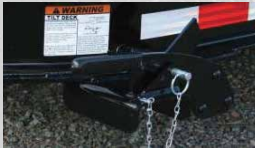
Single deck lever with dual latch securement is easy to operate.