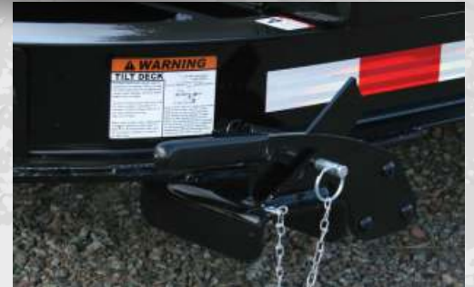
Single deck latch lever with dual latch securement is easy to operate.