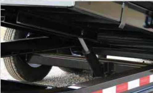
Cushion cylinder controls the deck when loading or unloading equipment.

Towmaster's drop-deck tilt trailers are the most popular tilt-bed trailers on the market. There are no ramps to hassle with; simply tilt the deck and drive on or off. This trailer is built on our cold-formed I-Beam tongue and main frame for tough durability. The tilt deck trailer features a single lever twin-latch system, knife-edge approach, rubber-ride axles and adjustable hitch. A deck cushion cylinder eases the deck back into transport position and prevents it from slamming onto the frame while loading.