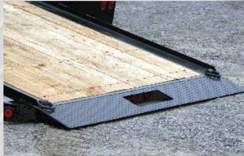
Approach ramp allows easy equipment loading and unloading.